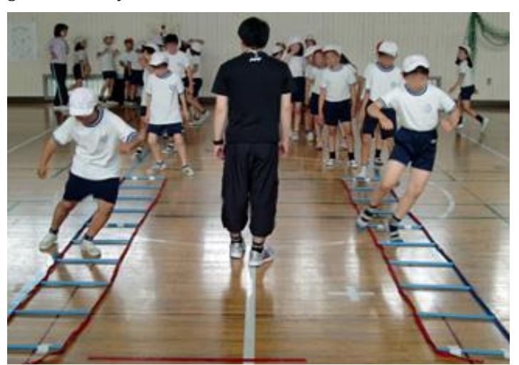
Figure 1. Agility ladder program (ALP).

rungs (squares) and not step on the ladder while moving their bodies as quickly as possible. For the quick run, participants ran over the ladder as fast as they could. For the lateral run, participants were instructed to stand inside a square, face the ladder's right or left side, and run sideways over the ladder. For the open and closed jump, participants repeatedly jumped into each square along the ladder, advancing one square at a time while alternately opening and closing both legs. For the twoleg zigzag step involves the child stepping with both feet simultaneously in left and right directions. The right foot is outside the square, and the left foot is inside the square when stepping to the front-right diagonally; the left foot is outside the square, and the right foot is inside the square when stepping to the front-left diagonally. The child moves one square forward at a time while doing this movement. The 27 participants in Group 1 were further divided into Group A (n = 14) and Group B (n = 13). One ladder was used by Group A, while the other was used by Group B. First, the instructor gave the participants a demonstration and then blew a whistle for the children to begin the activity.